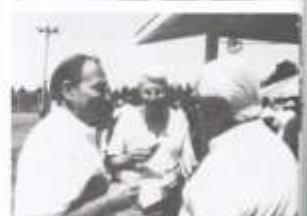
PIONEERS PICNIC 1990