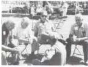
PIONEERS PICNIC 1990