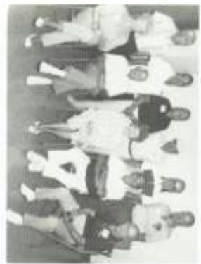
PIONEERS PICNIC 1990