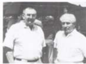
PIONEERS PICNIC 1990