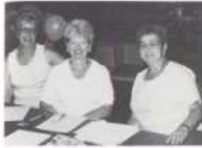
PIONEERS PICNIC 1989

These photographs are from 1989's Pioneers Picnic. See if you can find yourself or someone you know. We hope you enjoy them.