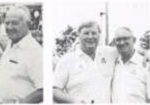
PIONEERS PICNIC 1986