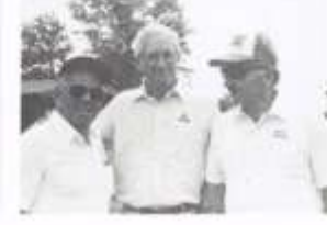
PIONEERS PICNIC 1986