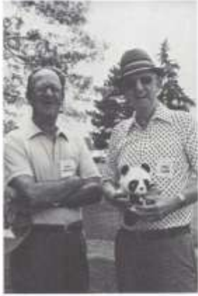
PIONEERS PICNIC 1986