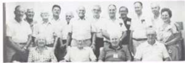
PIONEERS PICNIC 1986

The following photographs are from the 1986 Pioneers Picnic. See if you can find yourself or someone you know. We hope you enjoy them.