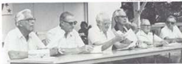
PIONEERS PICNIC 1982