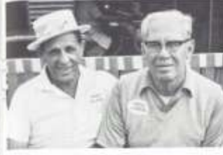
PIONEERS PICNIC 1982